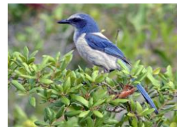
Florida Scrub Jay

Source: Florida Department of Health, CHARTS, downloaded February 7, 2018.