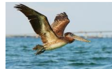
Pensacola, Brown Pelican

Source: Health Resources and Services Administration, downloaded January 8, 2021.