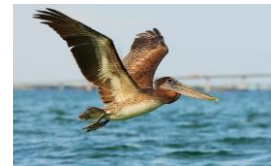
Pensacola, Brown Pelican

Source: Health Resources and Services Administration, downloaded October 13, 2021.