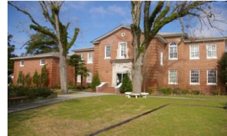
Liberty County Courthouse, Bristol