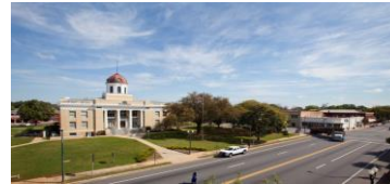
Gadsden County Courthouse, Quincy