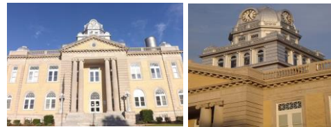
Madison County Courthouse, Monticello