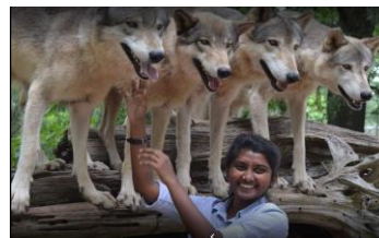
Seacrest Wolf Preserve, Chipley