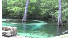
Ponce de Leon Springs State Park