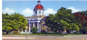
Jackson County Courthouse, Marianna

Source: Florida Department of Health, CHARTS, downloaded February 7, 2018.